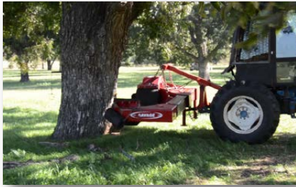
Preparing to clamp onto a “big one” with our largest model, the 2158