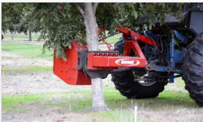
Clamped and ready to shake with our smallest model, the 2138