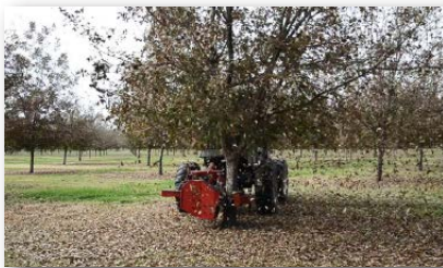
Just a few seconds of shaking brings a shower of leaves and nuts.

No other piece of orchard equipment takes the kind of punishment a tree shaker does. That’s why it’s important to go with a proven industry leader. By testing our equipment season after season in our own pecan orchard, we’re able to perfect Savage designs year-by-year, and produce equipment that provides real value and is built to last.